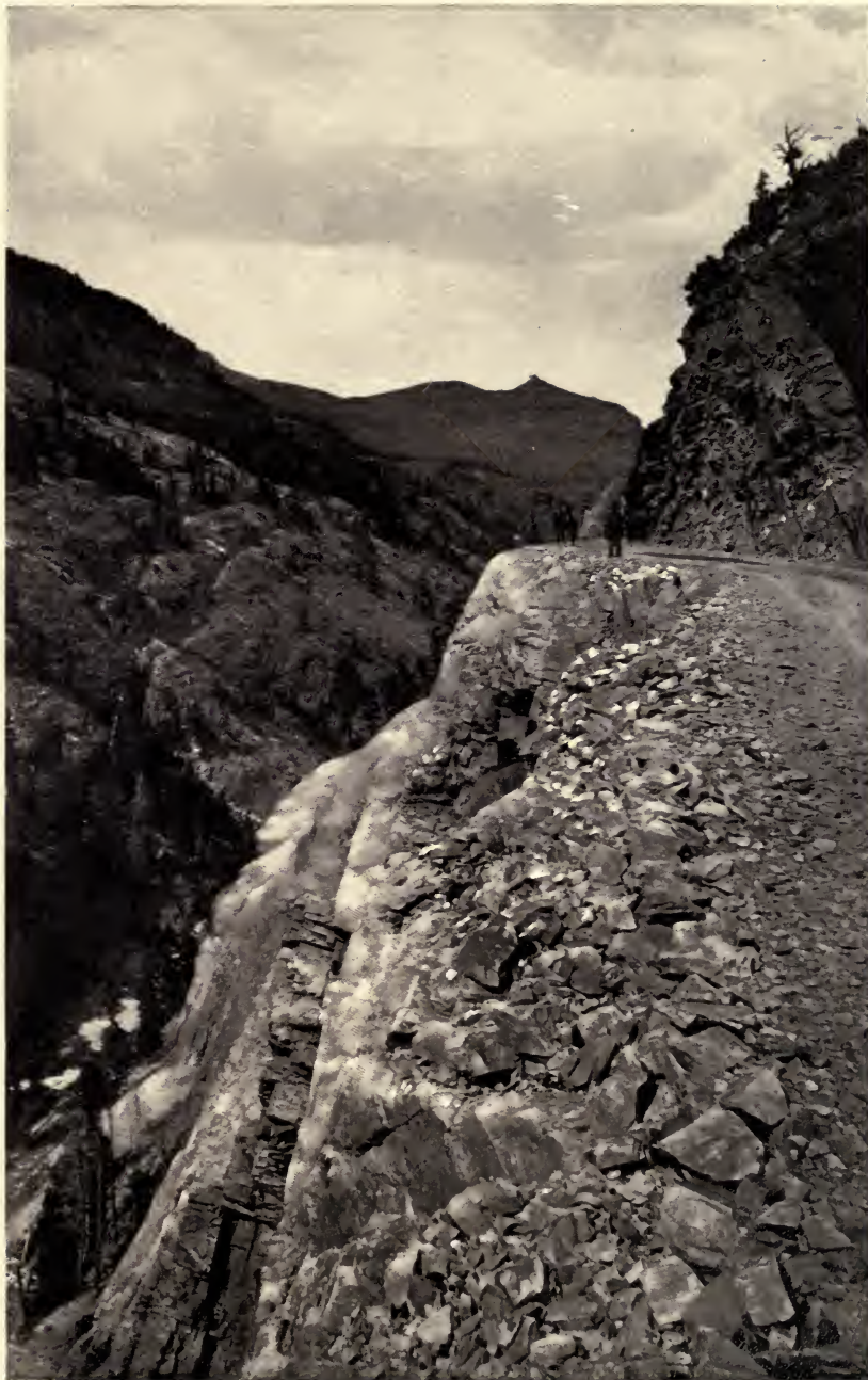
UNCOMPAHGRE CANON OURAY AND SILVERTON TOLL ROAD